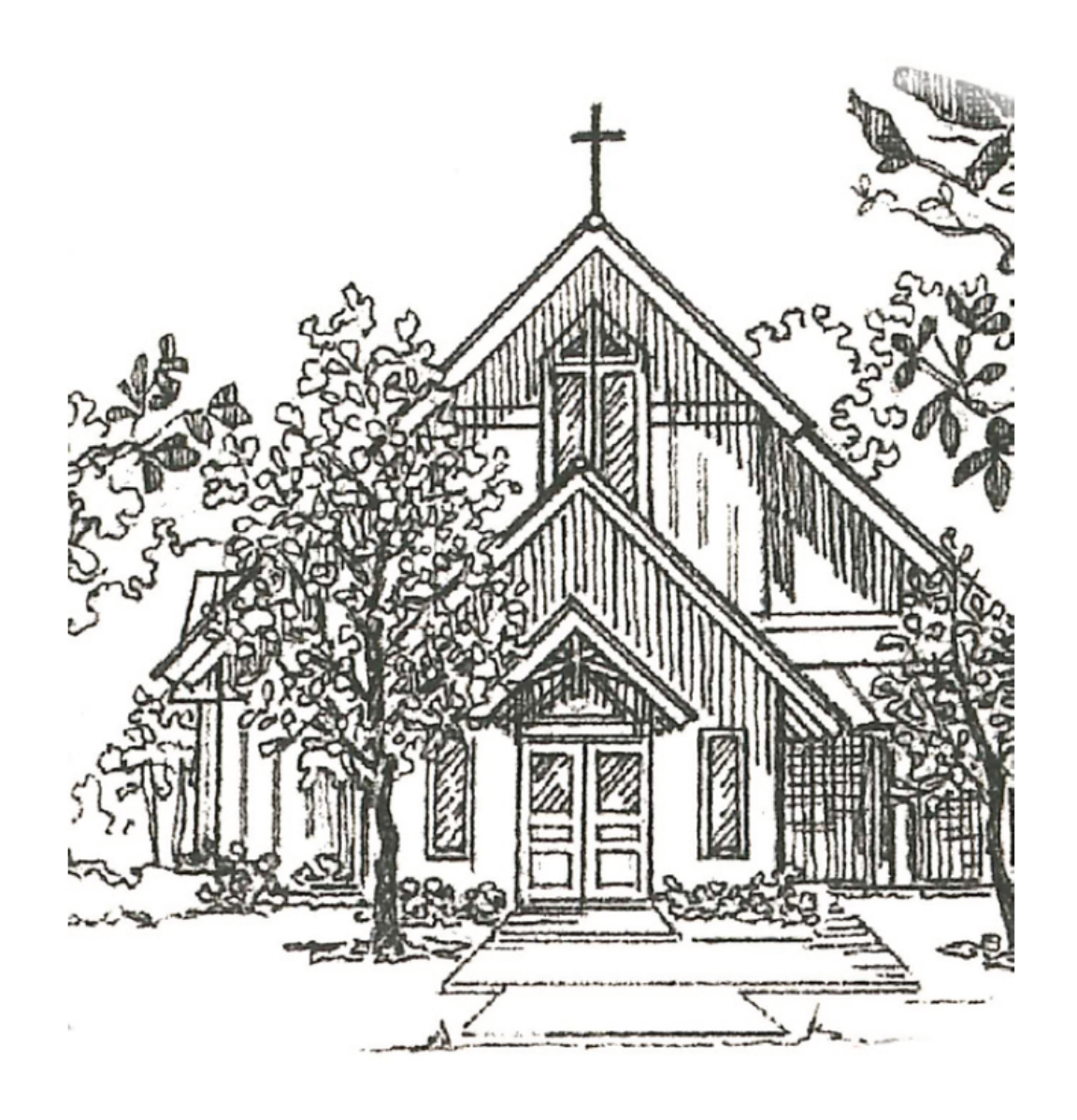
The 18<sup>th</sup> Sunday after Pentecost Holy Eucharist, Rite II October 1, 2023 10:30 am